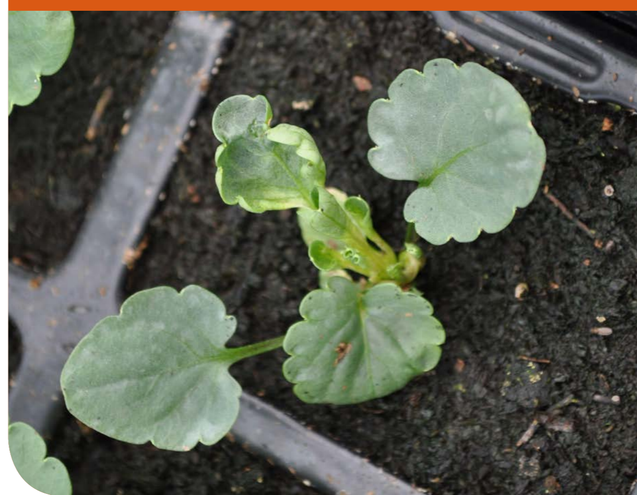
Loss of growing point