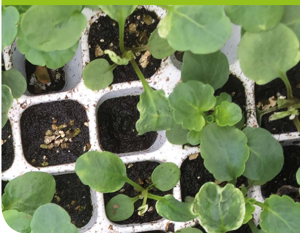
Loss of growing point